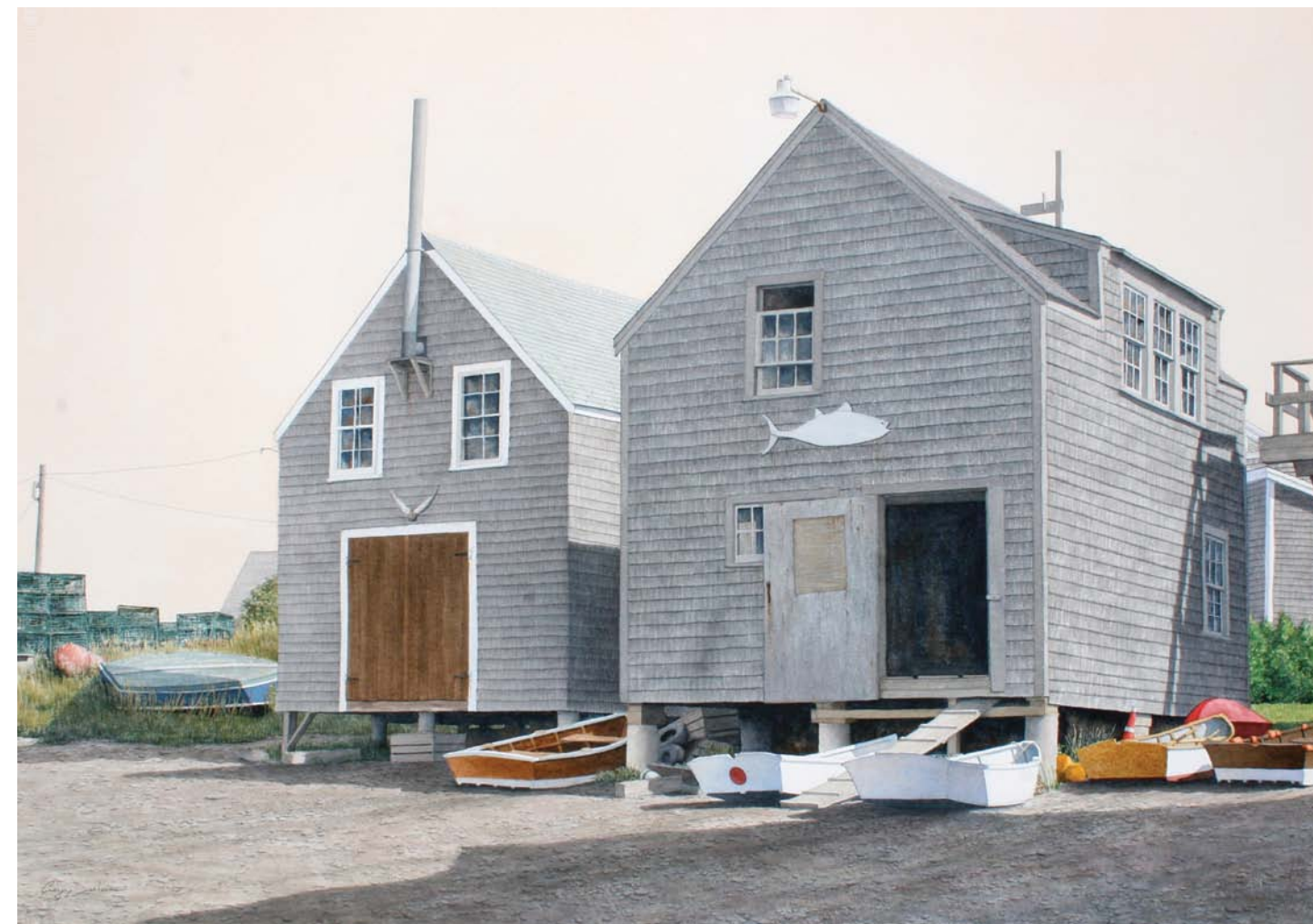
Fish Beach, Monhegan Island, 2009, watercolor, 22 x 30 inches