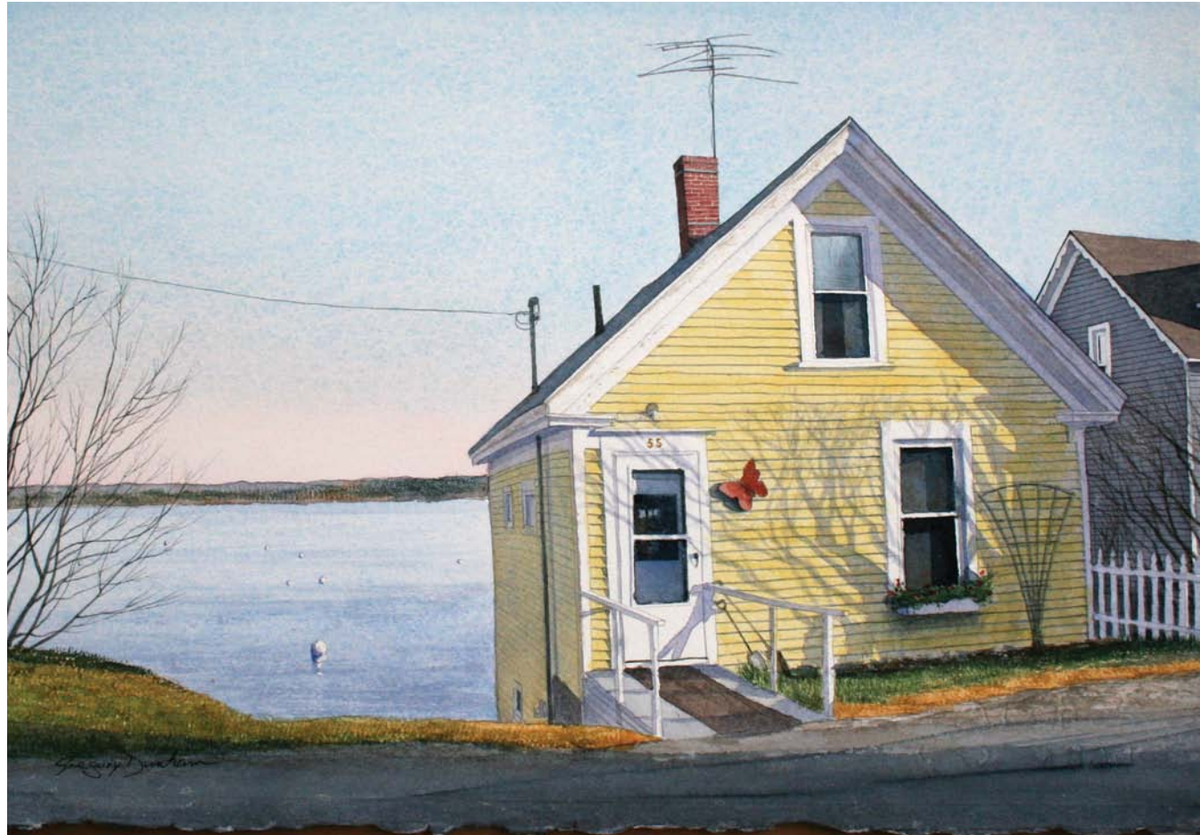
Butterfly House, Castine, 2010, watercolor, 10 x 15 inches