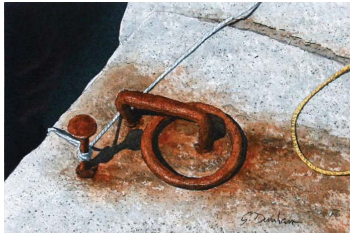
Boatyard Abstraction IV 2010 watercolor 4 x 6 inches