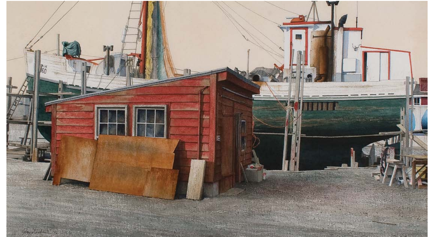
Up for Repairs , 2009, watercolor, 15 x 26 inches Received the Amee B. Davis Memorial Award, 2nd Summer Show 2009, Rockport Art Association