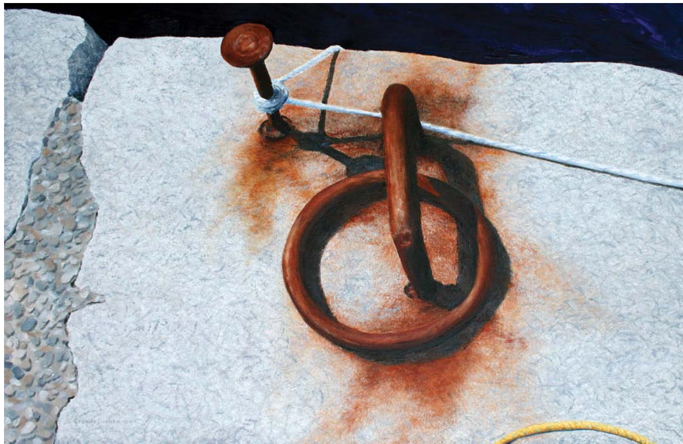
Granite Series III , 2010, oil on canvas, 20 x 30 inches