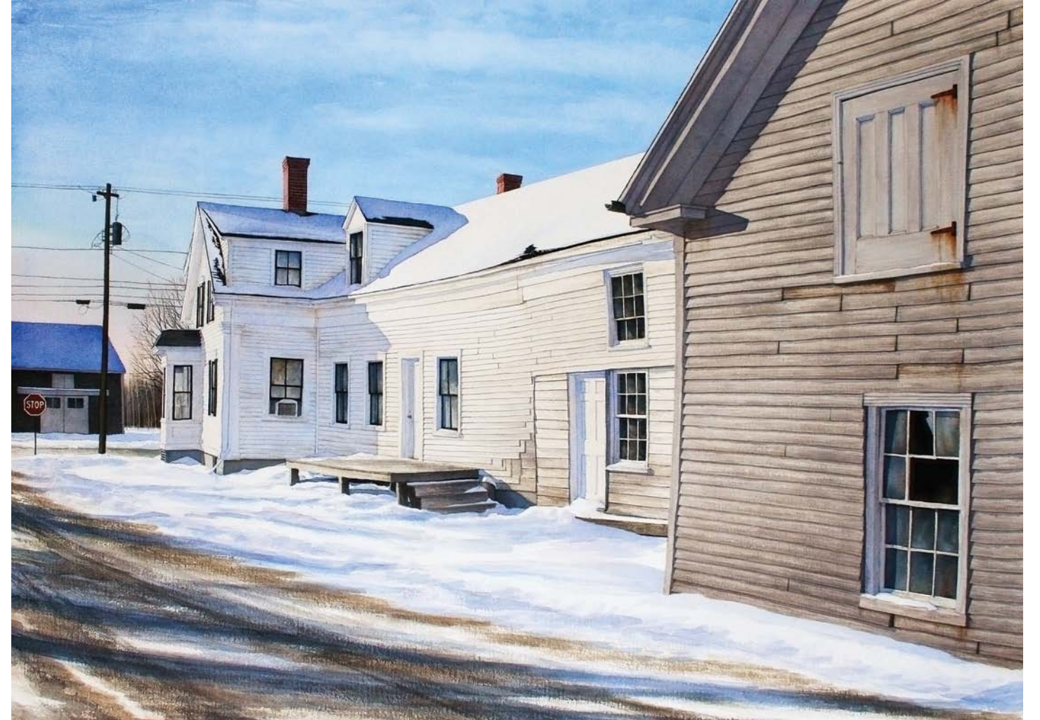
Morning Light, Searsport, 2010, watercolor, 25 x 41.5 inches