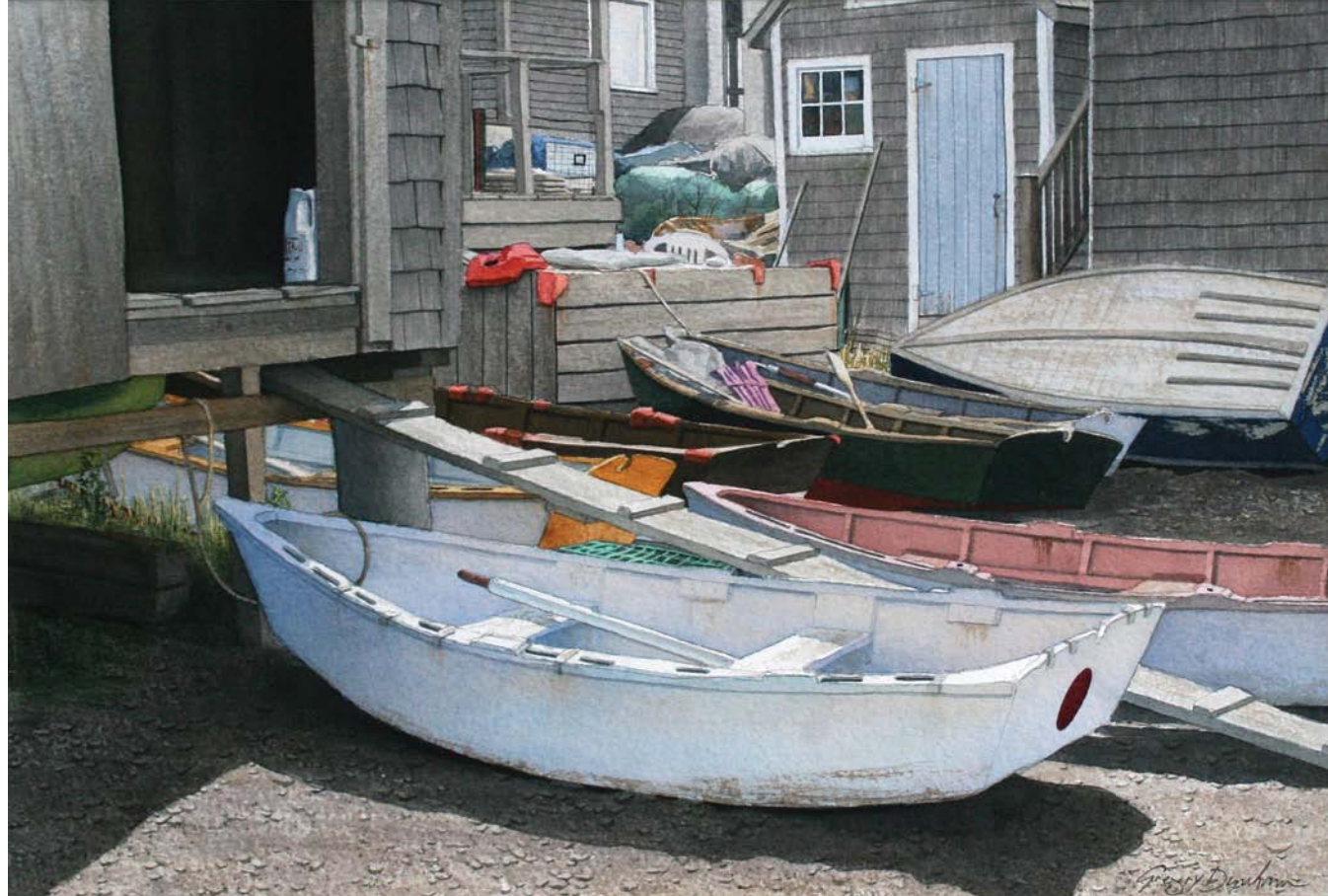
Skiffs at Fish Beach, Monhegan, 2009, watercolor, 10.25 x 15 inches COVER Red Boat, Lincolnville Beach, 2010, watercolor, 16 x 24 inches