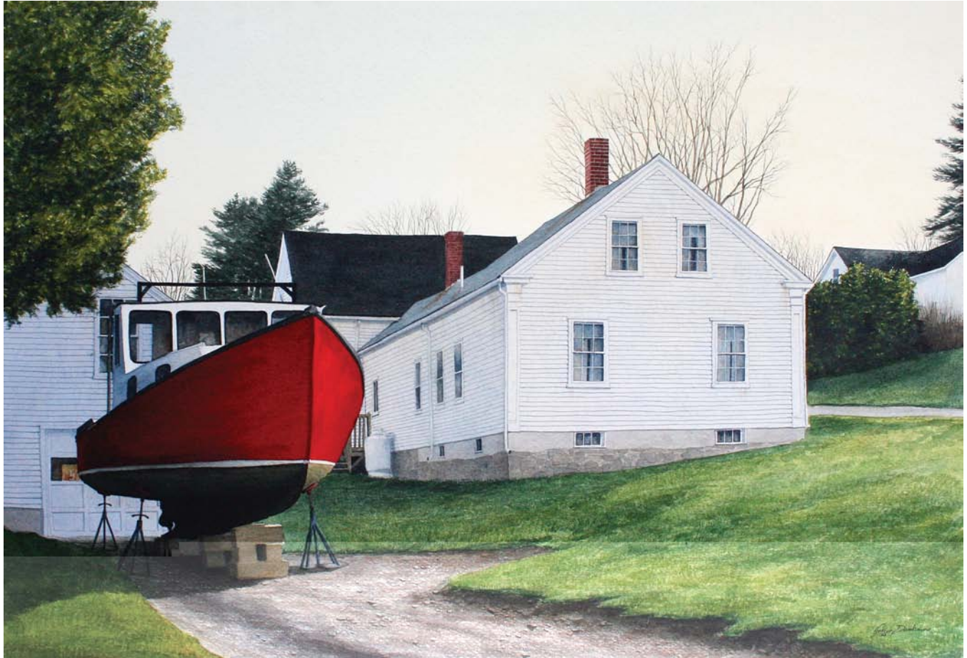
GREGORY DUNHAM COURTHOUSE GALLERY FINE ART