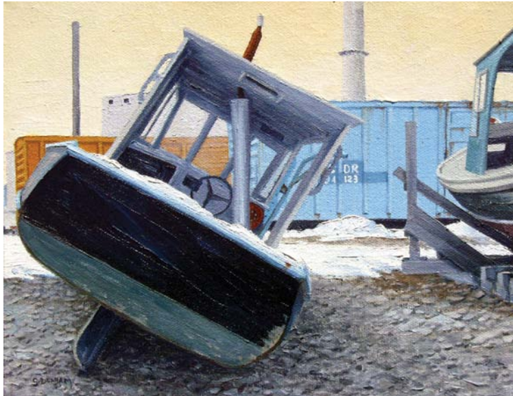
Waterfront, Bucksport, 2010, oil on canvas, 8 x 10 inches