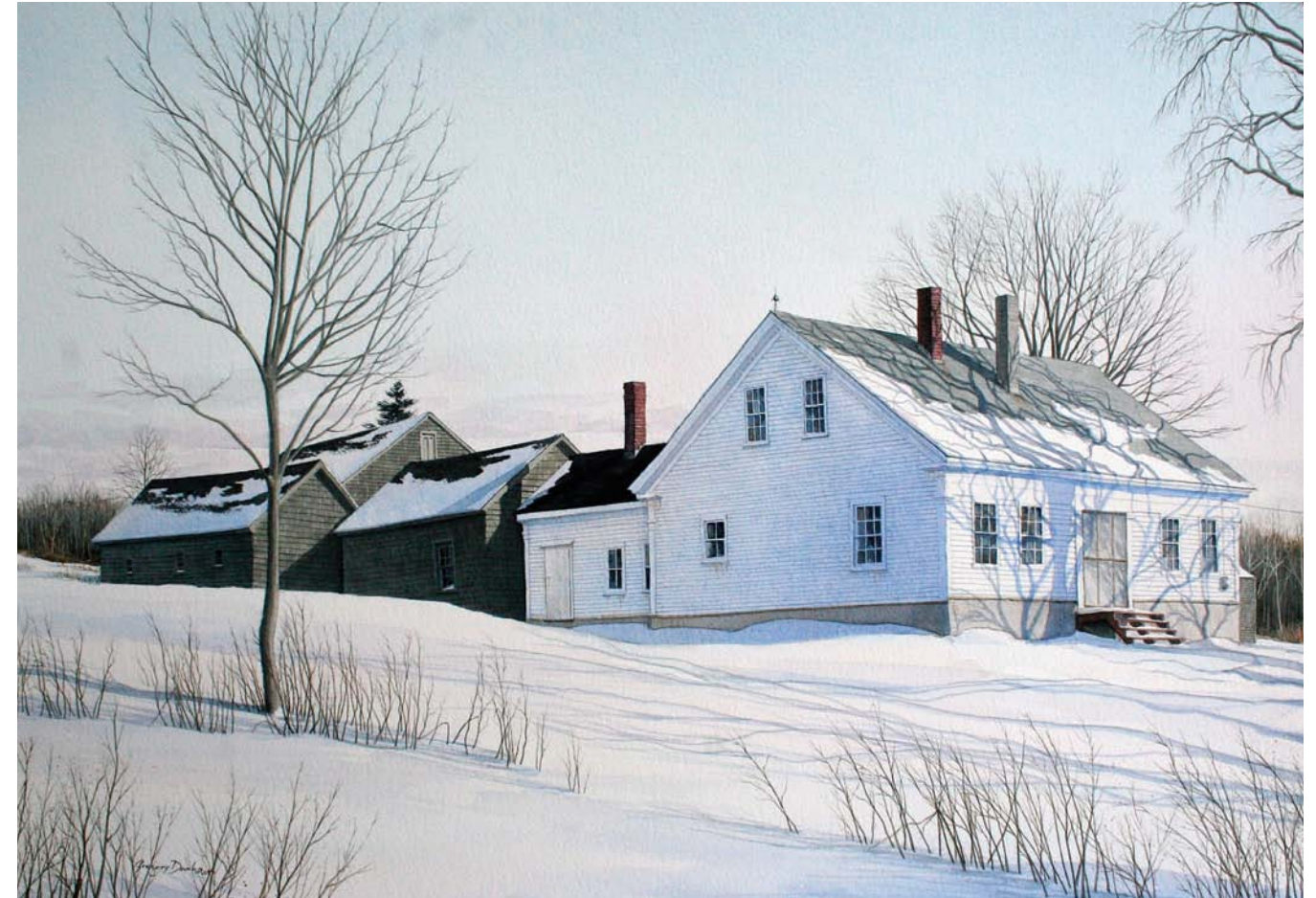
Lengthening Shadows in Winter's Stillness, 2010, watercolor, 15 x 22 inches