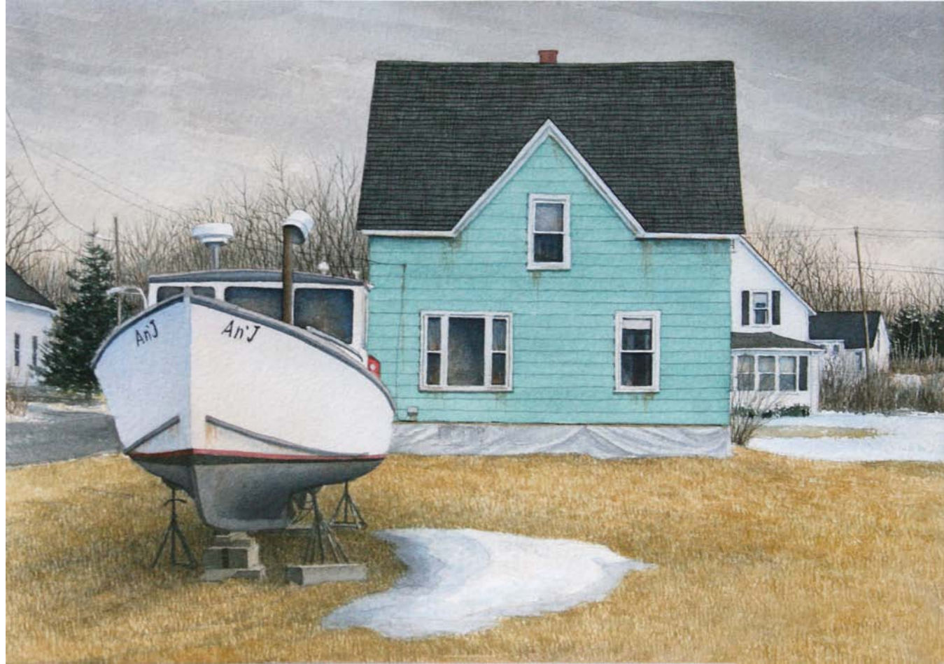
January Thaw, Rockland, 2009, watercolor, 8.5 x 12 inches