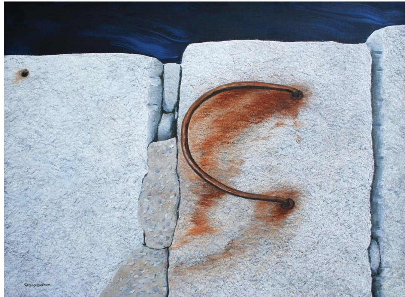
Granite Series I , 2010, oil on canvas, 18 x 24 inches