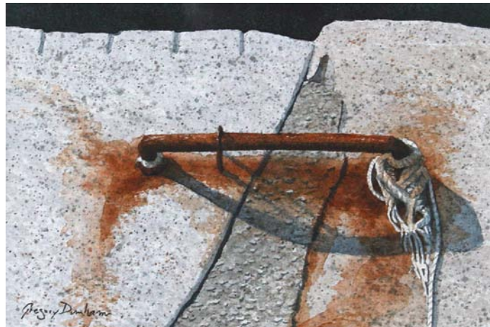
Granite Series II 2010 watercolor 4 x 6 inches