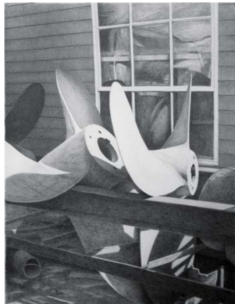
Propellers 1982 graphite drawing 22 x 30 inches