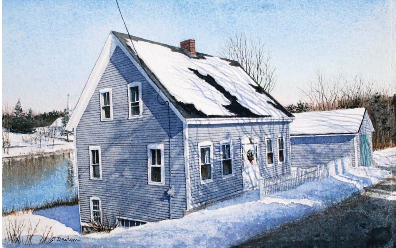
Along the River, Orland Village, 2010, watercolor, 7.25 x 11.25 inches