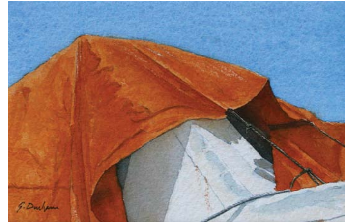
Boatyard Abstraction III, 2010, watercolor, 4 x 6 inches