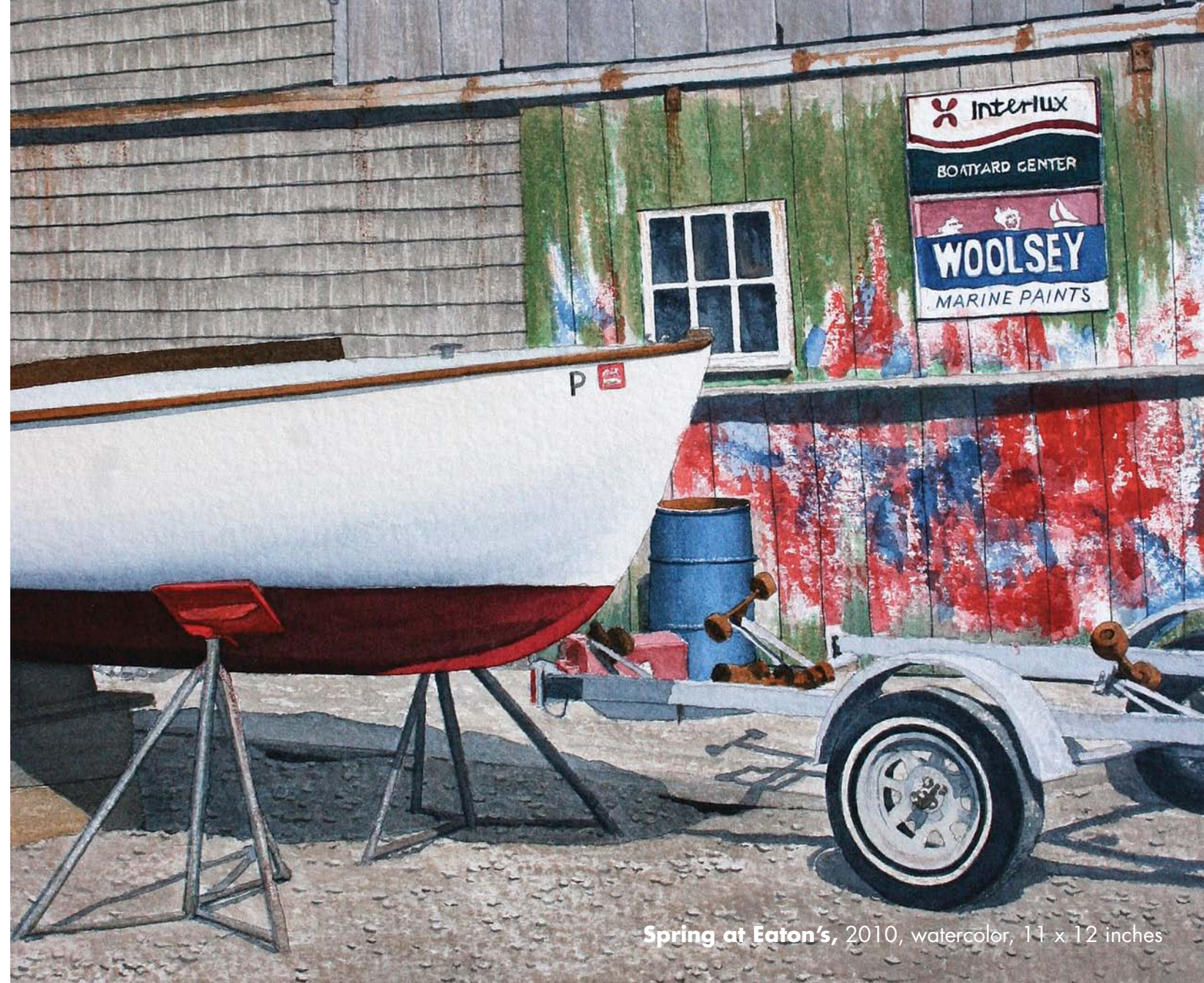
Spring at Eaton's , 2010, watercolor, 11 x 12 inches

New England School of Art, Boston, MA, 1964-65 Massachusetts Bay Community College, Boston, MA, 1965-67 Harvard University Extension, Cambridge, MA, 1974